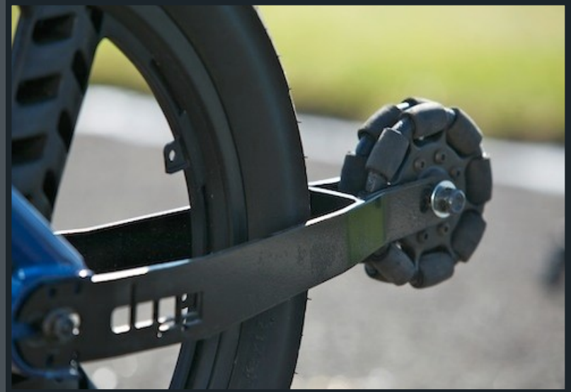
Dogg's innovative use of the Rotacaster allows riders to perform stunts with confidence.